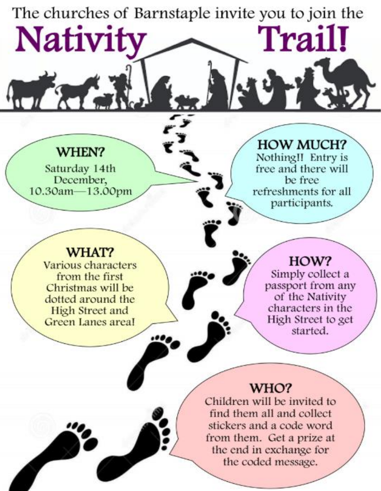
Free tea and coffee afterwards in the Parish Church